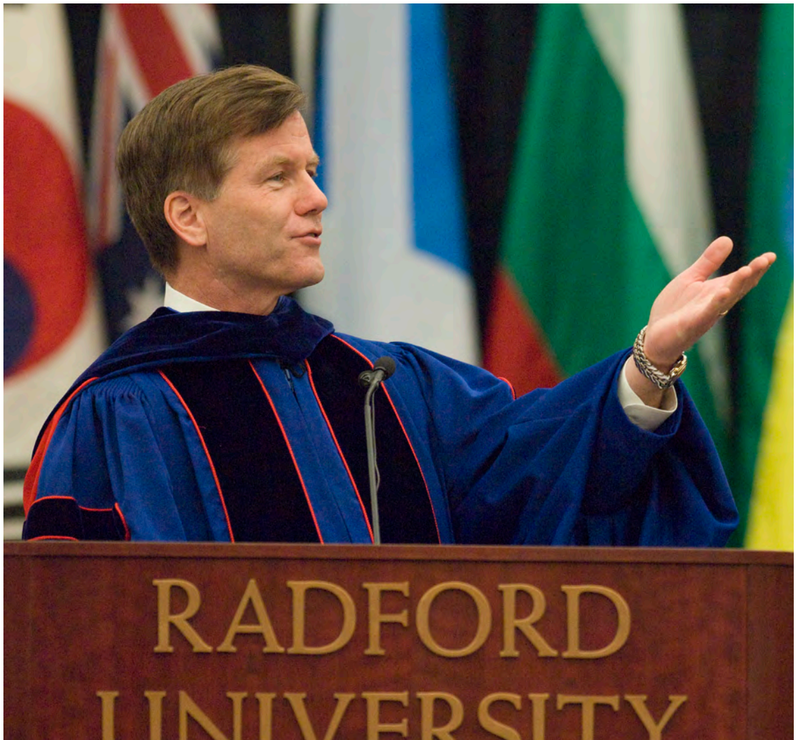
Governor Bob McDonnell recognized RU's rich history of service over the past century, telling alumni, distinguished guests, faculty and staff to look forward to the future.